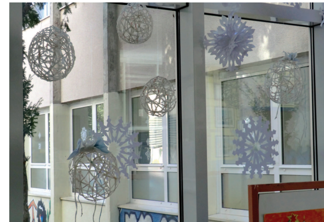
kreativni i unikatni ukrasi u atriju, likovna skupina