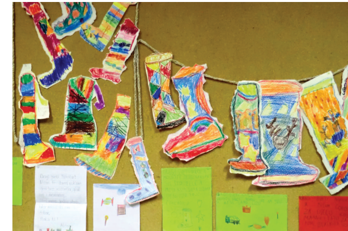
čizmicice od papira, 1.c