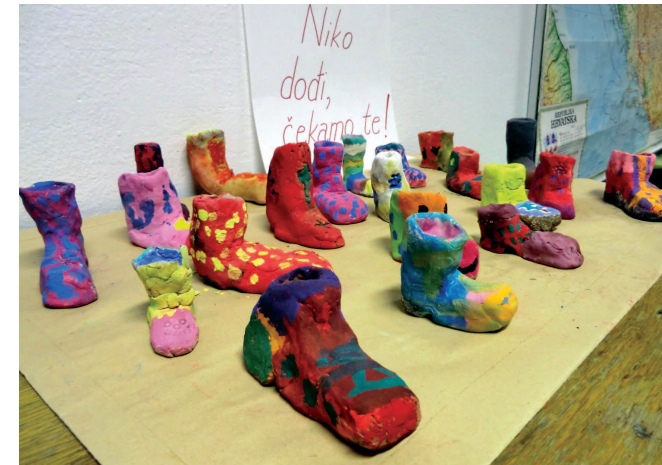
čizmicice od glinamola, 2.b