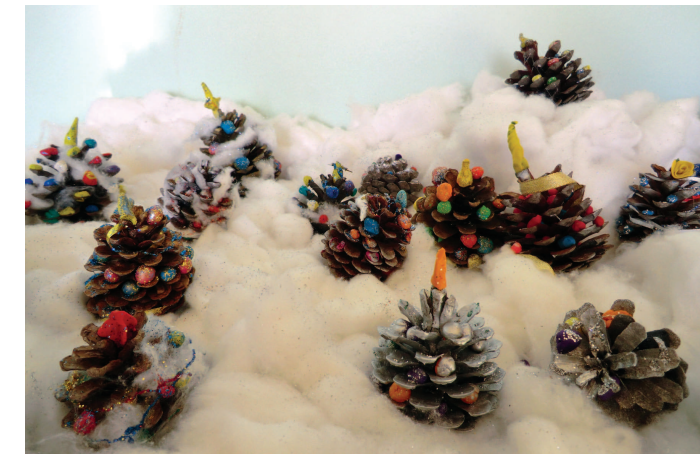
bijeli Božić, 4.a