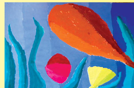
Juraj Buklijaš, 7.d